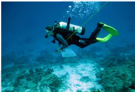
One of the marine scientists on her way to the reef.

Stony corals are highly susceptible to changes in water temperatures. Even a small temperature rise damages the symbiotic algae living in a cell layer of the corals causing their expulsion by the coral host. The corals, which depend on the photosynthetic energy of their symbionts, are hardly able to survive without them. The rise in ocean temperatures and coral bleaching are considered as the greatest threats to coral reef ecosystems worldwide. Therefore, natural retreat areas where corals experience less stress or have become more resistant through physiological adaptations are investigated.