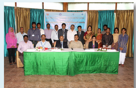
Participants of the Climate Change on Coral Reefs Workshop