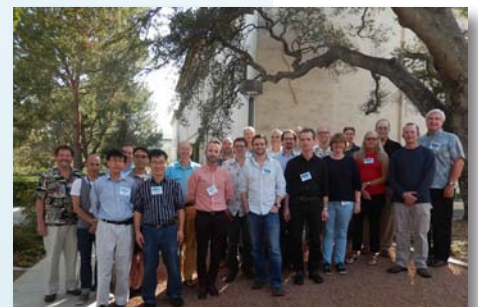
Attendees at the 2014 undersea-cable science workshop, including representatives from U. Hawaii, NASA, JPL, WHOI, NOC, Scripps, U. Wash, SAEON, KIOST, RSMAS, U Michigan, NERSC, NOAA, APL Washington, MIT, IRD and GFZ.