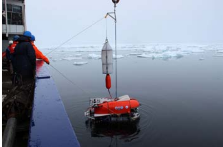
The Nereid Under Ice vehicle is launched from the Alfred Wegener Institute's ice-breaker Polarstern during an expedition in the summer of 2014

Scientists studying the harsh and rapidly changing Arctic environment now have a valuable new tool to advance their work—an innovative robot, designed and built at the Woods Hole Oceanographic Institution (WHOI) that is changing the way scientists can interact with and observe the polar environment.