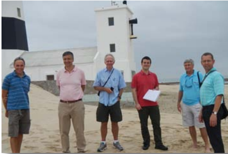
The Coastal HF Radar Team in discussion at the Cape Recife lighthouse.

Coastal high-frequency (HF) radar measures surface currents and waves, although it can also be configured for smaller areas such as harbours and bays. The measurements are in real time, with a resolution of a few kilometres. Excellent visual products are available from the data to interpret sea surface movement. Their uses include search and rescue, oil spills, ships entering/leaving harbours, offshore ship tracking, ocean surface currents, waves, tsunamis and storm surges, operational oceanography, remote sensing data validation, ocean modelling and physical oceanographic research.