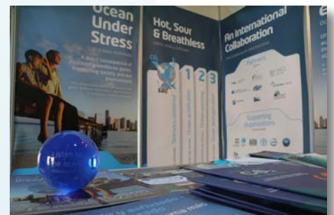
Exhibit at the United Nations Framework Convention on Climate Change 20th Session of the Conference of Parties.