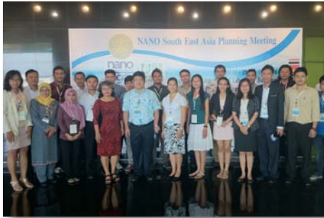
Participants of the NANO Southeast Asia Coordination meeting hosted by the Faculty of Science, Burapha University.