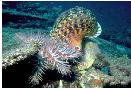
Triton 'eating' a crown-of-thorns starfish.