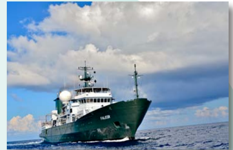
R/V Falkor